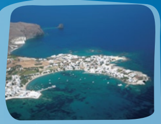
Pollonia , a charming fishing village and a stopover for sailing yachts.