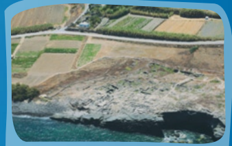
Phylakopi , the most significant Aegean city of Prehistoric times.