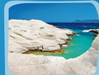
Sarakiniko , stunning white beach, reminiscent of a lunar landscape.