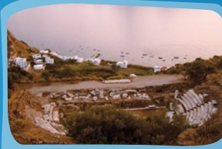
Ancient theater , its construction dates back to the Hellenistic era.