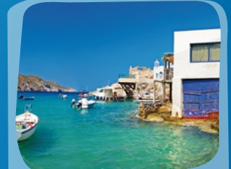
Firopotamos , another traditional fishing village.

Milos is the fifth largest island in Cyclades (24 islands in Cyclades total) located on the southwestern edge. It lies 86 miles (138.40 km) from Piraeus and locates in the middle of the route Piraeus- Crete. Is regarded to be the island of Venus , which symbolizes natural beauty, the island of lovers as many couples prefer this destination for their vacation and the island of colors due to its unique, picturesque places. Milos island can satisfy even the most suspicious tourist, who usually makes second thoughts about his next vacation destination. Is an ideal destination for your holidays as it has everything!