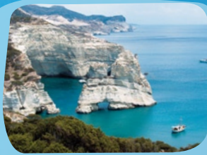
Kleftiko , the most famous and must see spot of Milos.