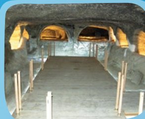
Catacombs , the most ancient monument of Christianity.